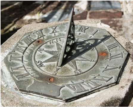
Fig. 1: Sundial 3

Various other instruments were used to measure shorter periods or when it was cloudy, such as the hourglass, a burning candle, or the outflow of water from a container. These methods tended to have a significantly lower accuracy on long-time scales. For example, for a water clock with a long spout, a change in water temperature of as little as one degree Celsius will cause a time measurement error of half an hour per day due to a change in viscosity and, subsequently, in the flow rate.